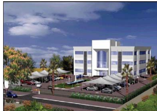
Data Centre Facility