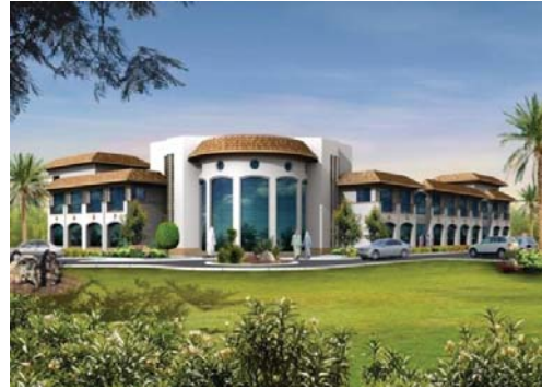
Senior Officers Accommodation