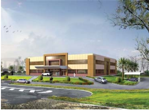
Data Centre Facility